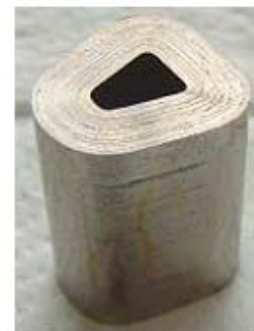
Figure 2: Amorphous rolled core